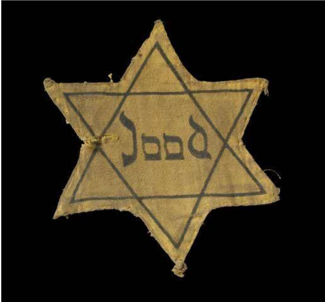
Figure 8. Photo of an actual yellow star used in Holland.

they were required to wear a yellow star so they could easily be distinguished from the rest of the population. The Dutch version of the yellow star was a slight variation on the German one: in Germany, the star had the word Jude emblazoned on it, written in a poorly executed approximation of Hebrew lettering in order to be as degrading as possible. The Dutch stars were imprinted with the Dutch translation: Jood .