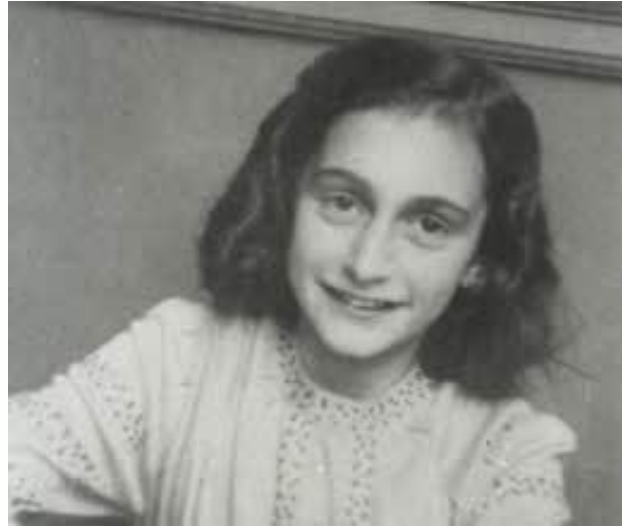
Figure 6. Anne Frank in June, 1942.