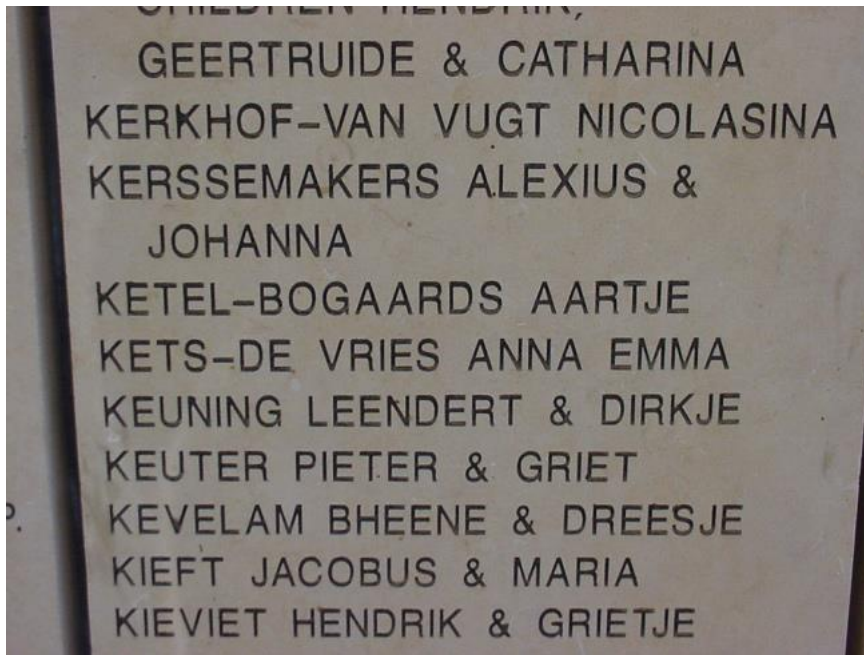
Figure 22. Aartje Ketel-Bogaard's inscription on the Wall of Honor at Yad Vashem.